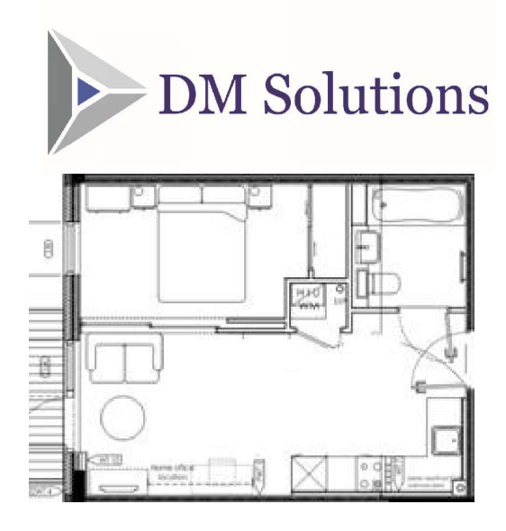
37m<sup>2</sup> LD1 'Kitchen Guard' Studio Apartment (no sprinklers)